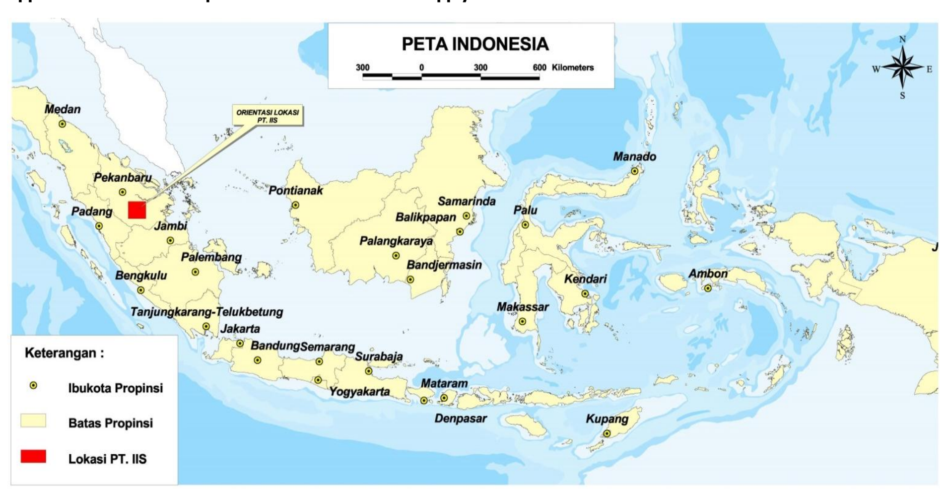
Appendix G: Location Map of Certification Unit and Supply bases

...making excellence a habit.™ Page 114 of 119